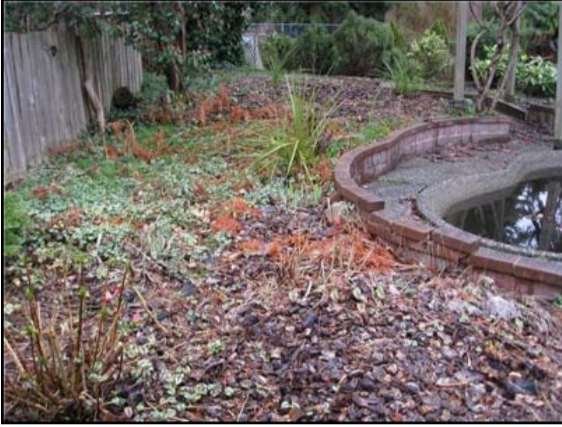
South Surrey Before

Before and after pictures of work in Surrey. Click on the images for larger versions.