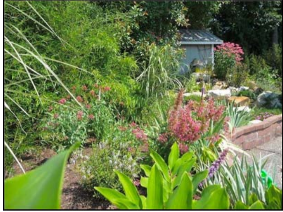
South Surrey After