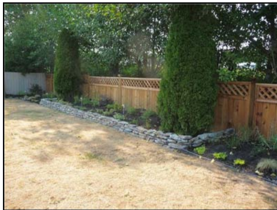
Back After 2