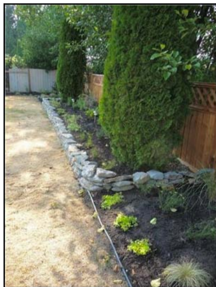
Back After 1